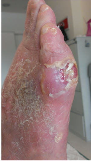
FIGURE 6: Foot diabetic ulcer at admission.