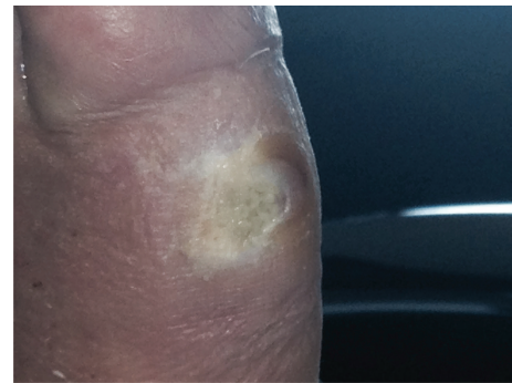
FIGURE 8: Complete diabetic ulcer healing at discharge.

In the last two decades there has been an increasing interest in the PEMF for the management of ischemic, pressure, and venous ulcers. The basic mechanisms underlying EMF are not clear. PEMFs are low frequency fields with very specific shape and amplitude. They can be applied in