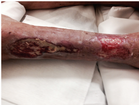
FIGURE 3: Seven days after EBS treatment and standard dressing.