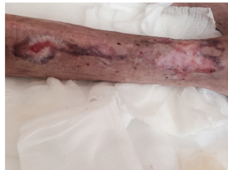
FIGURE 5: Skin ulcers completely heal after 5 weeks.

and showed extensive right leg ulcers. These lesions had a necrotic appearance, without granulation tissue, and were covered by purulent exudates (Figure 2).