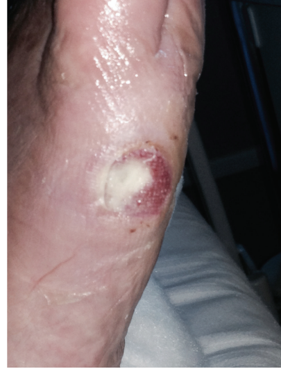
FIGURE 7: Wound epithelization after 10 days of EBS treatment.

A skin examination performed at the time of admission showed a foot ulcer of about 2.5 cm involving the fascia, and it was evaluated as grade II according to the Wagner grading system (Figure 6) [11]. An X-ray of the foot was performed and showed no occurrence of osteomyelitis.