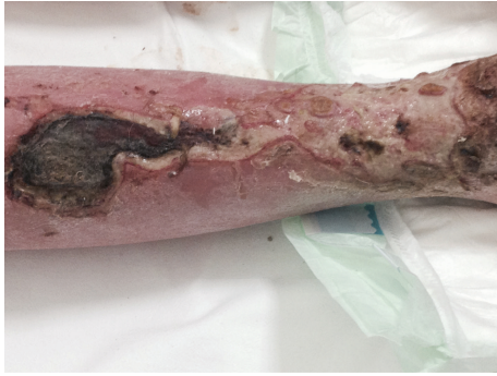
FIGURE 2: Initial gangrene of the lower limb at admission.